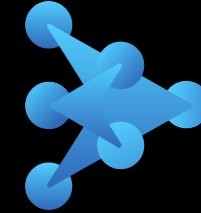
AI & ML