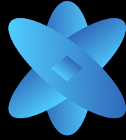
CLOUD AND DEVOPS